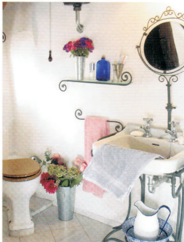
Above: Jim and Fiona's kitchen with the original beams still visible. Right: Their elegantly decorated bathroom. Below: Fiona and Rosie.

In the short space of two years, www.rent-a-villa-in-tuscany.com has grown into one of the most popular villa rental sites on the Internet. From its modest beginnings, the site now promotes a wide range of properties for all tastes and budgets including restored farmhouses, luxury villas, country golf clubs and medieval castles.